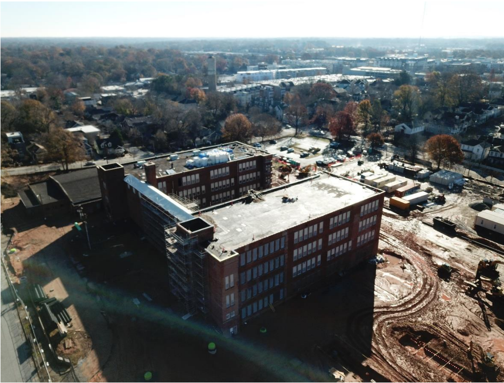
Project overview facing Northwest