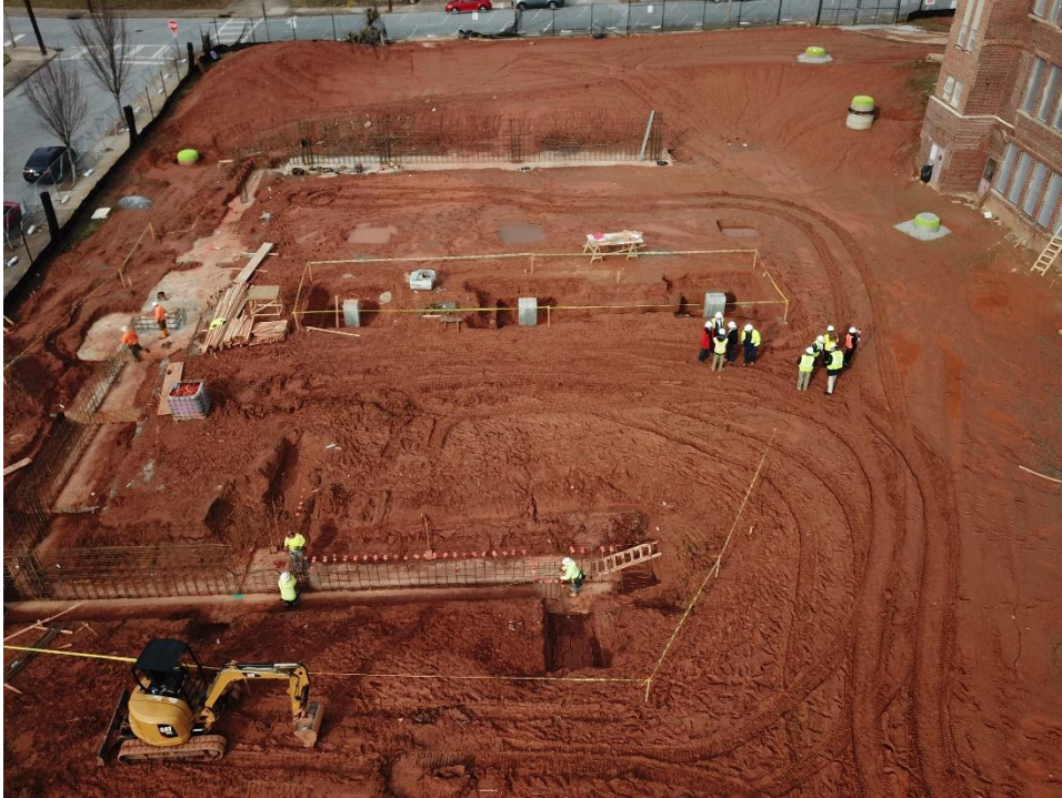
Access roads being installed